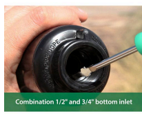
Combination 1/2" and 3/4" bottom inlet